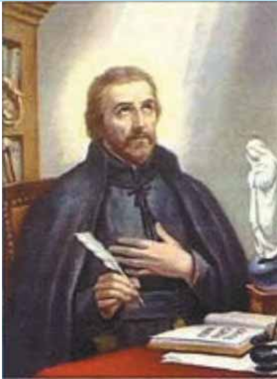
SAINT PETER CANISIUS, S.J. Doctor of the Church (1521 – 1597) Patron Saint – Catholic Press, Germany Feast Day – December 21

This eminent Jesuit was born in Nijmegen, Holland (when it was part of Germany), May 8, 1521. At twenty-two years of age he joined the Society of Jesus and distinguished himself in studies and spiritual direction. He was the second great Apostle of Germany, preacher, theologian, and leader of the Counter Reformation.