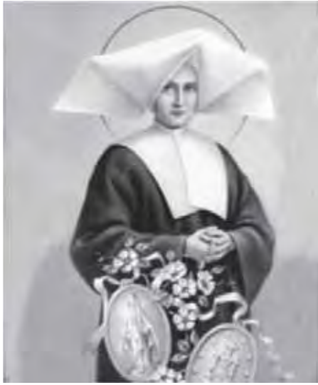
SAINT CATHERINE LABOURÉ (1806 - 1876)

Patron Saint of the Miraculous Medal Feast Day - November 28